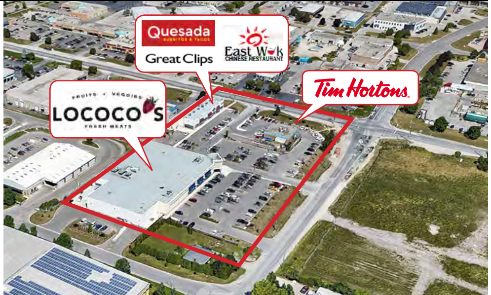
After - Fully leased by Goudy Real Estate