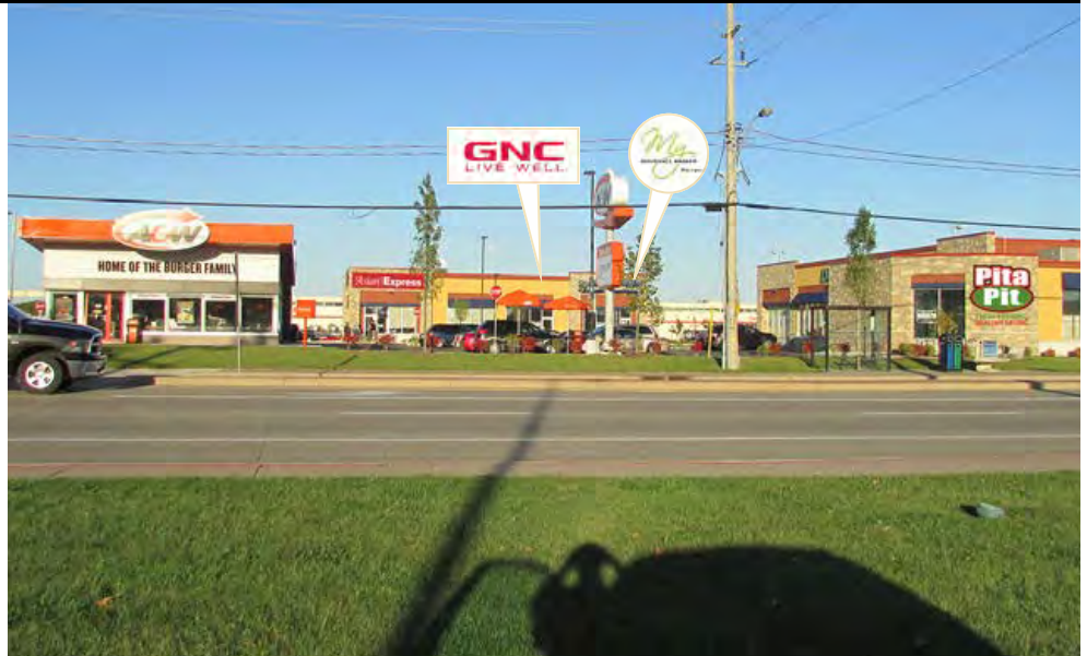
After - Fully leased by Goudy Real Estate